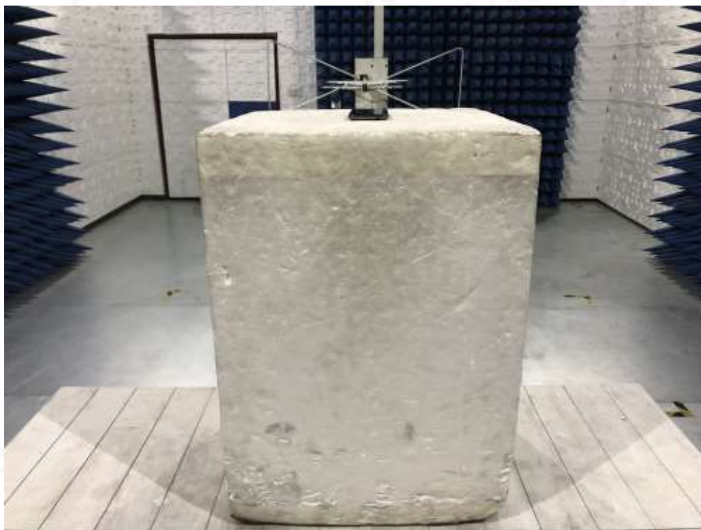
RADIATED SPURIOUS EMISSION-ABOVE 1G TEST SETUP